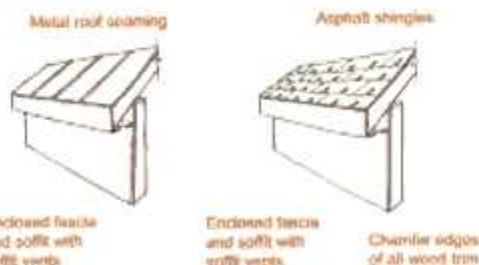
Enclosed fascia and soffit with soffit vents

Use Rated Roofing Material: The roof can be the part of your home most vulnerable during extreme wildfires. If firebrands fall on a roof with untreated, nonrated roofing, the entire roof can ignite, destroying the home. In contrast, roofing material with a Class A, B, or C rating, such as composition shingle, metal, and clay or cement tile, is fire-resistant and will help keep the flame from spreading.